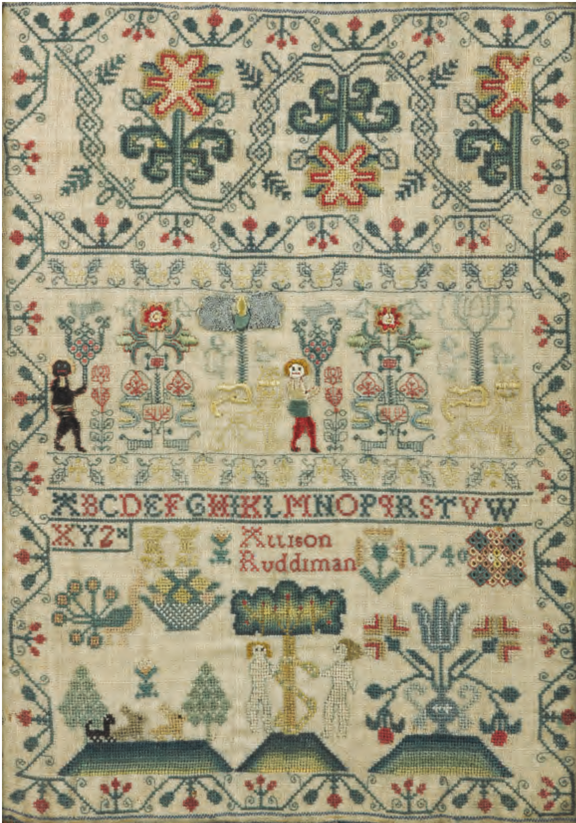
ABOVE. 7.8 Allison Ruddiman, 1740. 12\frac{1}{2} in (31.8 cm) x 8\frac{3}{4} in (21 cm). NMS A.1993.103.