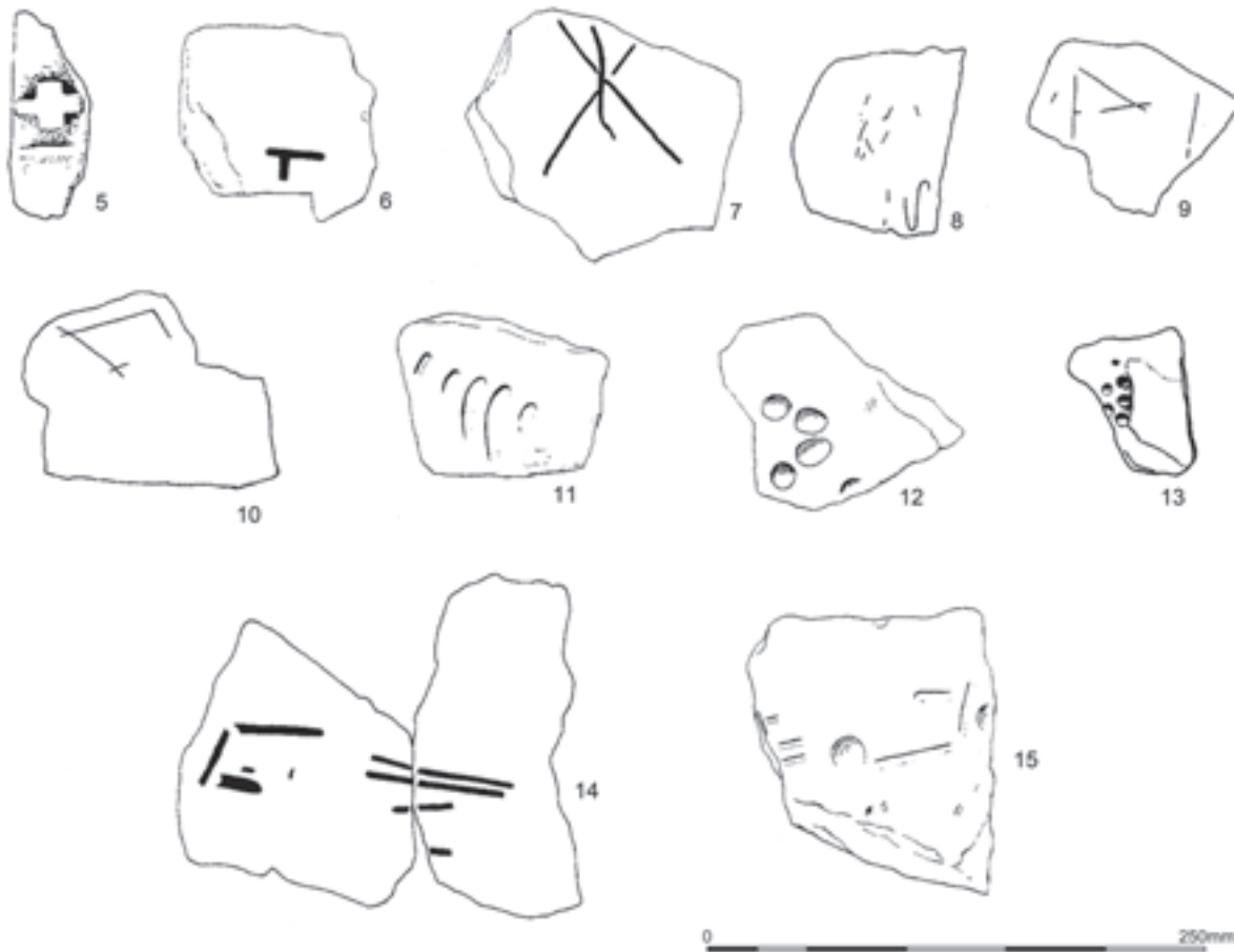
Illustration 6.4 Marks on tiles.

Restored tiles measured 290mm by 280mm, with a thickness of 30<35mm. The estimated weight of a single floor tile was 4.2kg. A total of 41.34kg was recovered during the excavation, which represents about ten tiles, a fraction of the number needed for the bath-house. The similarity of width with that of the box flue suggests that they were designed to fit as infill tiles between the