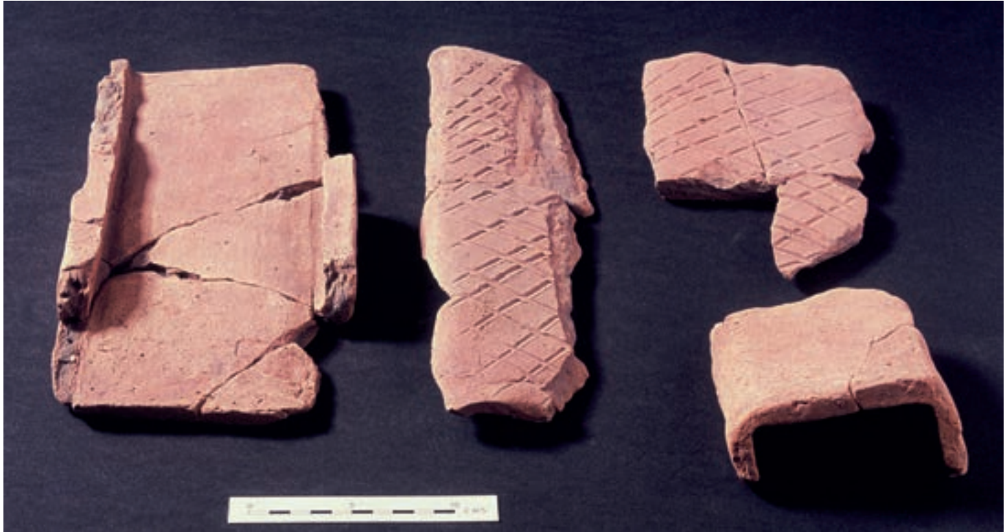
Illustration 6.1 Photograph of box tiles.

Most of the tile was in a soft orange-red fabric, with a grey core, similar to pottery Fabric 4. There was a small amount in a