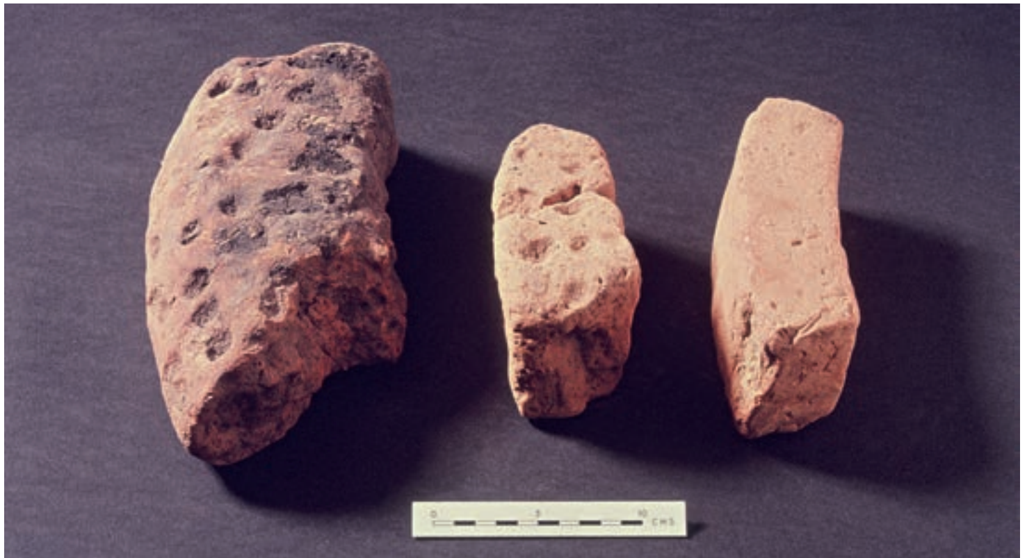
Illustration 6.3 Photograph of the curved bricks.