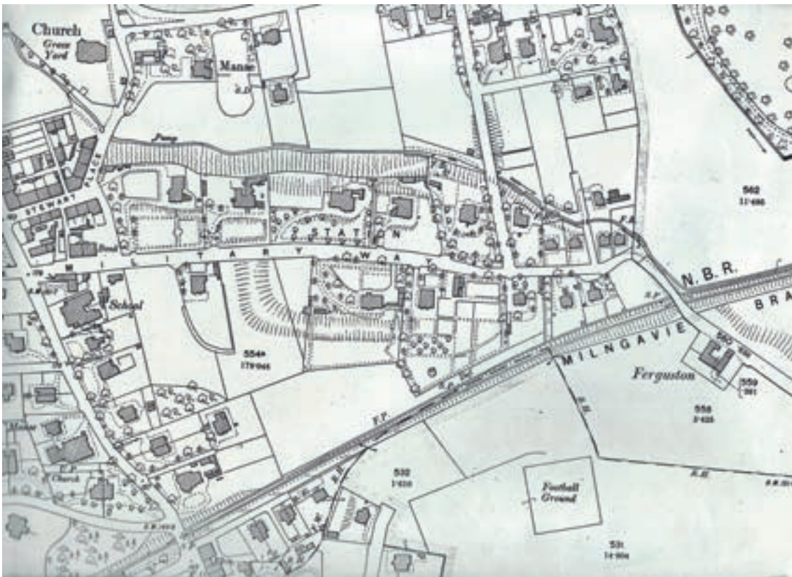
Illustration 2.4 The OS 1896 map of Bearsden.