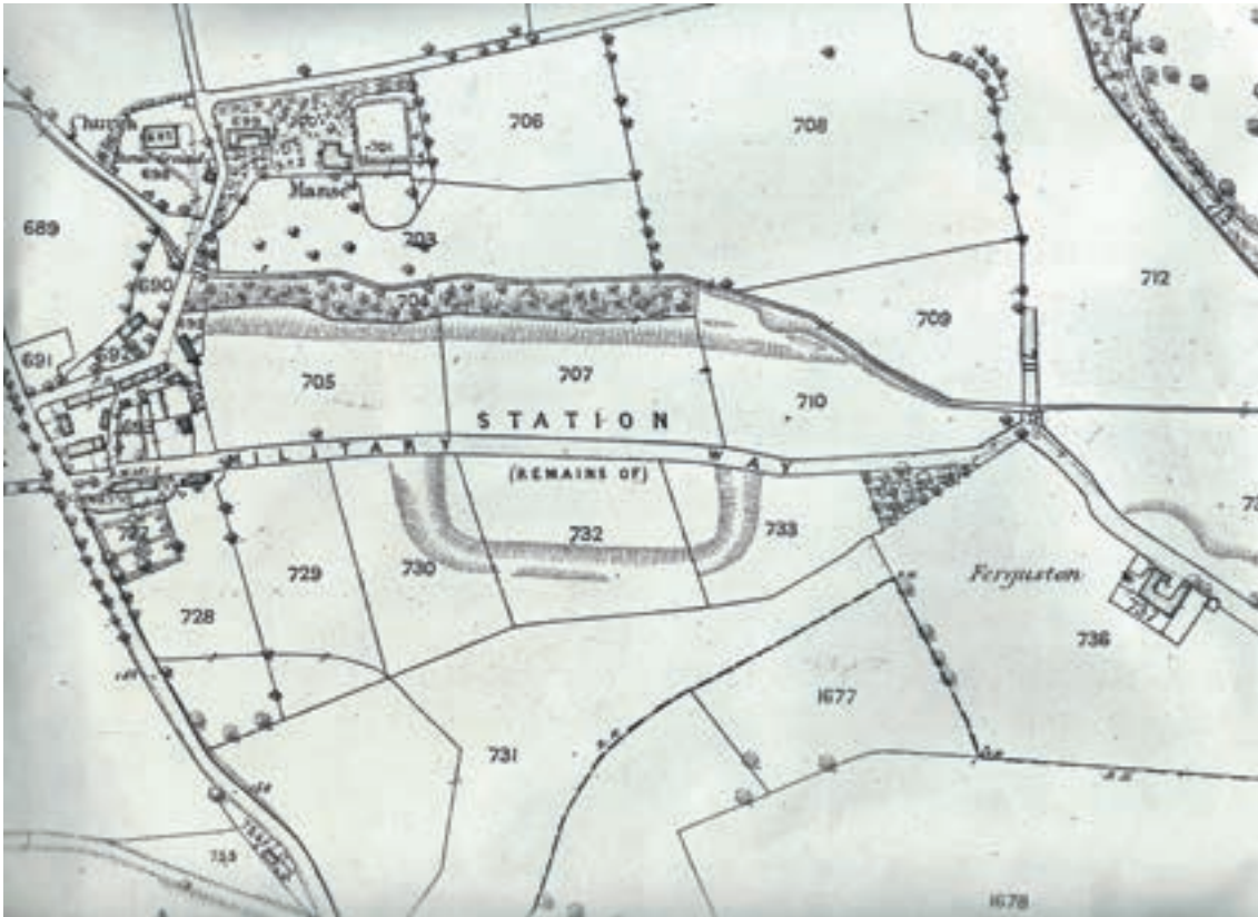
Illustration 2.3 The OS first edition map of Bearsden, 1862.