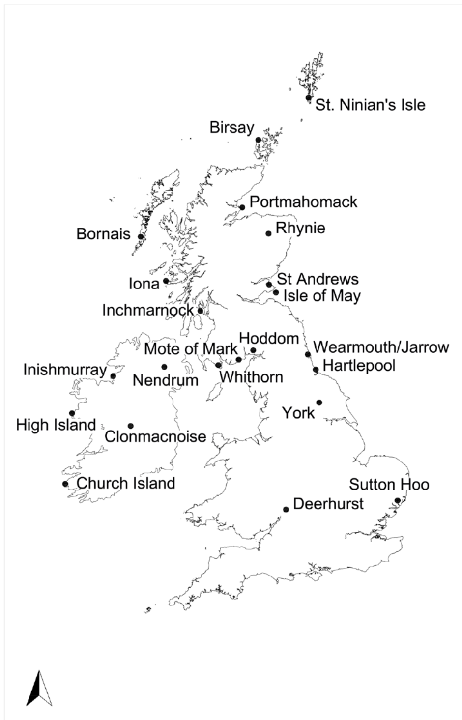
Illustration 8.4 Insular places mentioned in the text

The adaptability of some members of the community and the dispersal of others is consistent with a period of war. The