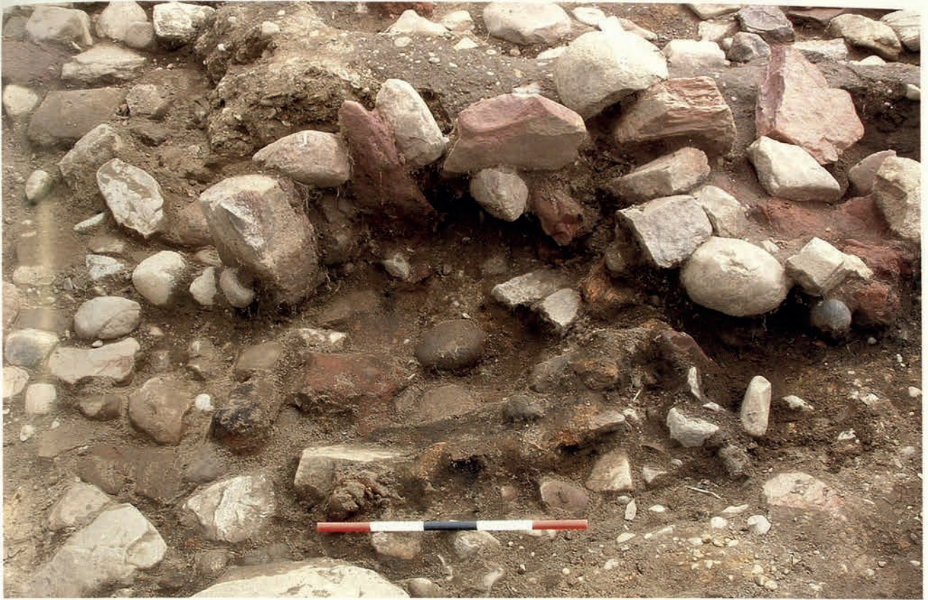
Plate 4 Knowes: oven in Circular Structure 2