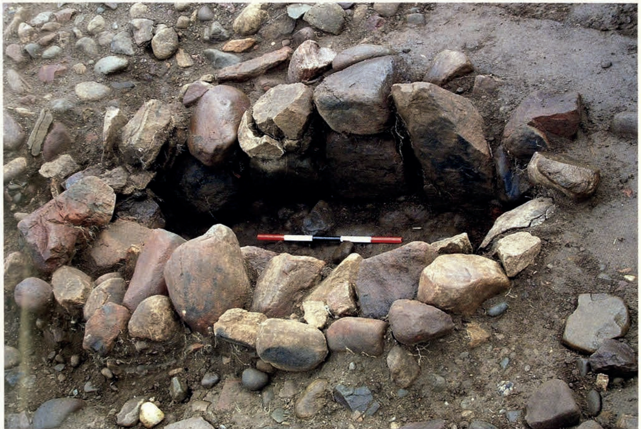
Plate 5 Knowes: the cist in southern ditch terminal