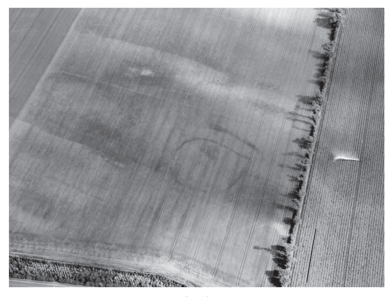
Figure 1.2 Enclosure at Seton West Mains, Port Seton (NT47NW 214). Discovered in 2004, this enclosure lies within 350m of the sites at Fishers Road West and East excavated in 1994–5 (E12990CN, Crown copyright: RCAHMS)

plain, however, sites are rare or non-existent, the area just east of Traprain being a good example. What this signifies has been a matter of some debate. Land use and soil quality are certainly factors in the extent of cropmark formation, but the nature of the distribution may well also reflect some underlying truths. Cropmarked site densities are undoubtedly highest in areas of well-drained soils, while in some pasture areas past land use will have levelled sites that are then unlikely to produce cropmarks. Equally, on the poorer-quality land used for pasture – for example on the fringe of the Lammermuirs – there are apparent gaps in the distributions of what might be comparable earthwork sites. Possible explanations are discussed in later chapters, but it is hard to avoid the conclusion