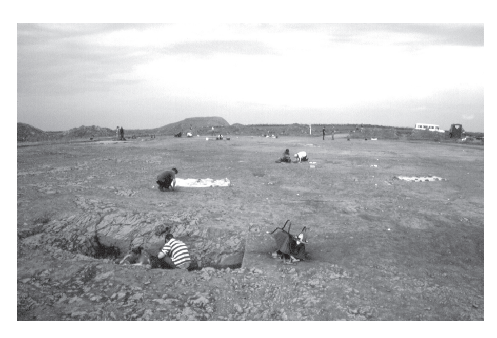
{\it Figure~1.4} The enclosure at Standingstone under excavation in 2003, Traprain Law in the background

The geomagnetic surveys were originally timetabled for the autumn-winter of 2000-01, with excavations scheduled to start in 2001. In the event, work was suspended in February 2001 owing to the outbreak of foot and mouth disease, and the surveys were not completed until 2001-02. The results, if anything, exceeded expectations, fully justifying the decision to invest time and resources in the surveys. In addition, the Edinburgh Archaeological Field Club undertook a trial resistivity survey of the enclosure at Standingstone, but in the event the results did not add significantly to those produced by magnetometry and the experiment was not taken further. No artefacts were picked up during the geophysical surveys, suggesting that a more extensive fieldwalking programme would have been of little value for locating or characterising such sites.