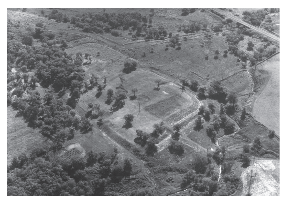
Illustration 99 The fort at Rough Castle, seen from the north-west. The lilia pits are at the bottom left (© Crown copyright. Reproduced by courtesy of Historic Scotland).

the Roman frontier line, thus avoiding any loss to its constituent elements.