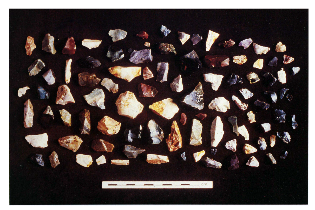
Frontispiece: A selection of lithic debris from the site at Kinloch illustrating the variety of raw material used.